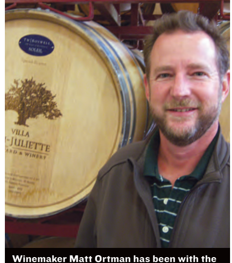
winery since 2012.