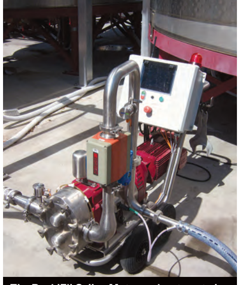
The RapidFil Cellar-Mate semi-automated wine transfer system.

The crush pad is equipped mainly with machines from The Vintner's Vault in Paso Robles. Workers dump bins into an Imma hopper and elevator that raises