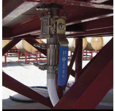
Tanks are connected to the Pulsair system with valves in the bottom.

Cellar workers fill and rack barrels with a Rapidfil Cellar-Mate system. As Ortman describes the benefits of the automated and accurate system, cellar hand Nenow methodically fills a row of barrels, moving the filling wand each time the machine sounds an alert tone to indicate a barrel is full. Ortman said a good check valve on the wand also ensures the pump doesn't suck up lees during racking, and a sensor picks up low flow to prevent gurgling or air getting into the line during racking. The cellar staff clean dirty barrels with a Gamajet barrel washer and give