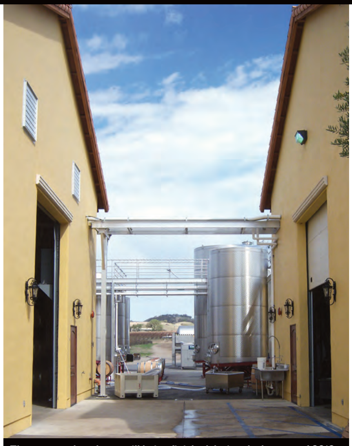
The new crush pad was still being finished during the harvest of 2013.