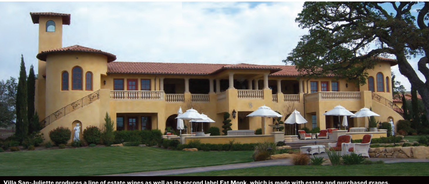
Villa San-Juliette produces a line of estate wines as well as its second label Fat Monk, which is made with estate and purchased grapes.